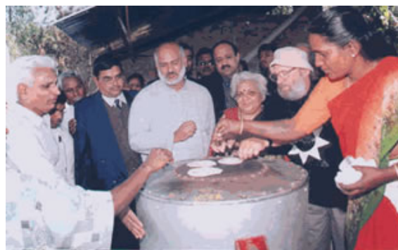
Demonstration of the storage system making chapattis.

The workshop for the principals of the schools was organised on 22 nd January 2000, it as a very successful event with about 100 participants coming from MP and other States. The highlight of the workshop was the inauguration of the only working model of a solar storage cooking system worldwide.