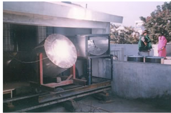
Photo shows the storage cooker and the direct cooker on rails.

At this time we built another secondary reflector and another cooking place. This and the storage system were fitted together on a heavy channel frame, then mounted on rails so that when the temperature of the storage cooker had reached a maximum, the unit could be moved and the direct cooking place brought into the focal area of the Scheffler dish, so that no sunshine would be wasted.