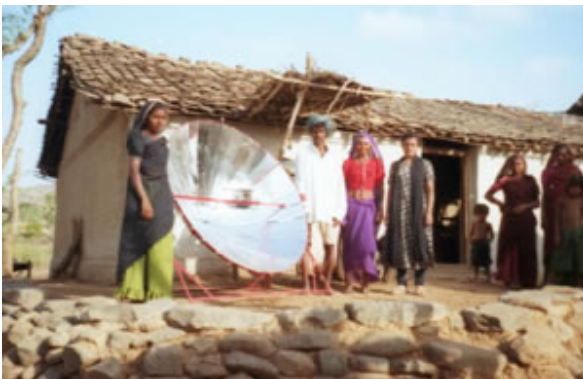
An SK 14 solar cooker in front of a tribal home.