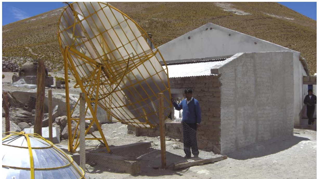
Fig.2: Solar community oven powered by Scheffler reflector

kitchens were without use, so a modification for using it as a solar community bakery could be done with little effort.