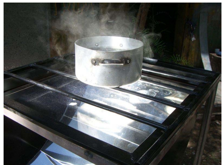
Fig.6: Ceramic glass as protection for the secondary reflector (better use black pots ;-))