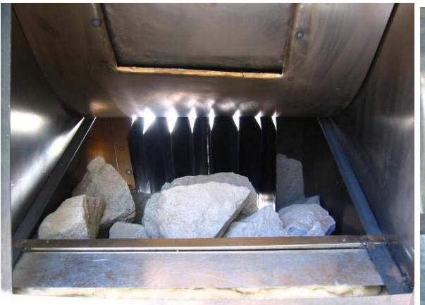
Fig.4: Efficiency curve for the zic-zac receiver