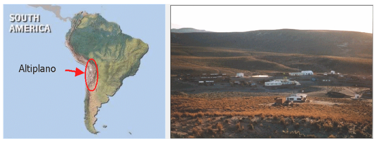
Fig.1 Geographical location of Altiplano and a typical village with 150 inhabitants (Misa Rumi)

The sole energy source in the region is the sparse vegetation provided by tola bushes. Only people with better income can afford gas cylinders. Increasing population and over-grazing leads to growing disappearance of vegetation. This causes increase in effort and time needed to collect firewood. The project aim is thus to make solar technology available to the villagers as an alternative to the traditionally used fuel for cooking, house heating and hot water production. The use of solar pumps together with drip irrigation systems ensures the provision of vitamin-rich vegetables and basic foods, such as potatoes. The villagers benefit from these solar projects, as their living conditions are directly improved as a result. The following technologies were introduced and used in the framework of co-operation with the local NGOs during pilot projects in the region: